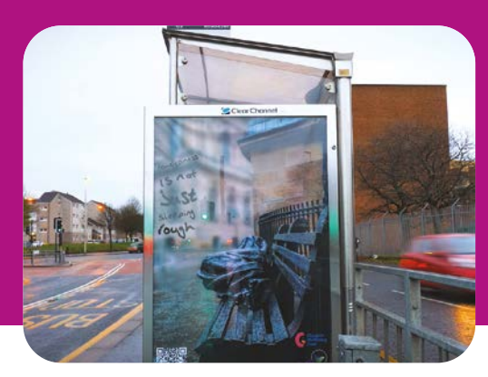
Bus Stop Poster

"It was...inspiring to be like, oh she's went through the same, I'm not weird...There is something good that can come out of this, helping people make art out of my horrible experience. If that's gonna help somebody else then I feel like I've achieved something in life, like out of that horrible experience"