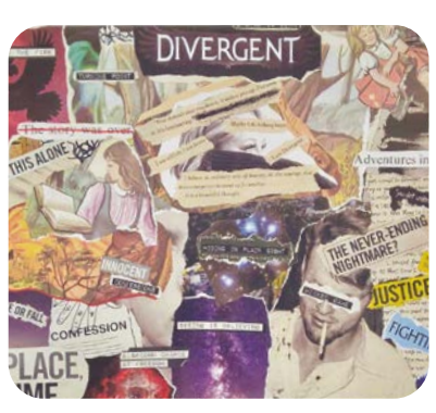
Art & Storytelling Group Collage

There have been no recordable incidents this year. However, some of the young women do feel emotionally low at times with suicidal ideations. Staff at the project support the young women with self-care and emotional support, and also link in with crisis support teams.