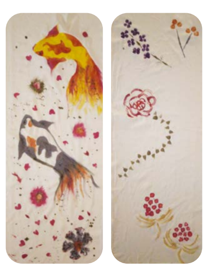
Natural Dyes Workshop Group

Our partnerships with Renfrewshire and North Lanarkshire Councils continue to be successful, with NLC now moving into funding the project via their Rapid Rehousing Transition Plan (RRTP). Benefits include wider awareness amongst the councils' workers of the behaviours and coping strategies of young women who have experienced sexual abuse or violence. Councils also work directly with young women to ensure safety from further abuse. We are working on further expanding our TS4S service to other areas with support from the Scottish Government's Third Sector Homelessness Fund.